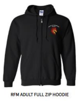
C$45.00 Item #RFMG18600