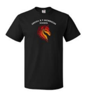
RFM SHORT SLEEVE TEE C$20.00 Item #RFMF3930/RFMFL39V/RFMF3930B

You can order R. F. Morrison Pride Wear! Just visit <u>https://www.9promotions.ca/r.-f.-</u> <u>morrison-school.htm</u>, customize your items and orders will be delivered directly to the school.